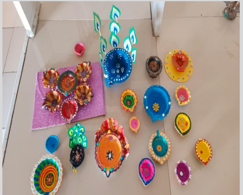
Art's & craft Event