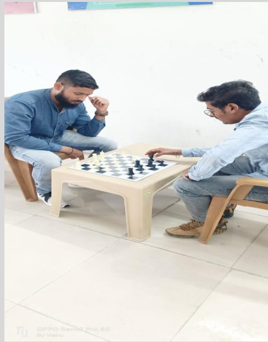
Sports Day Celebration