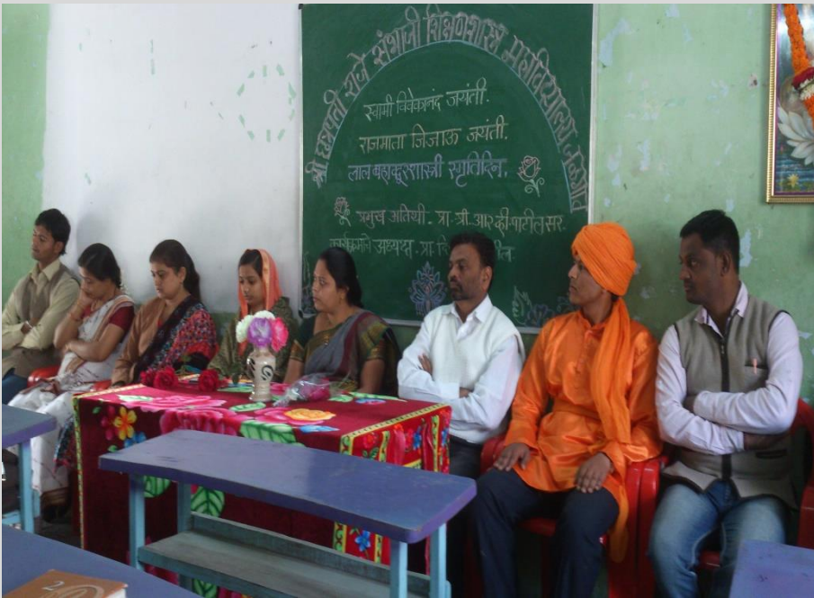
Yuvak Day Celebration