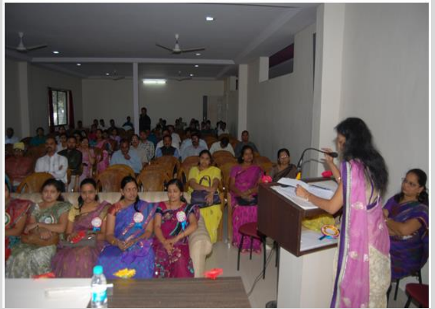
Research National Conference