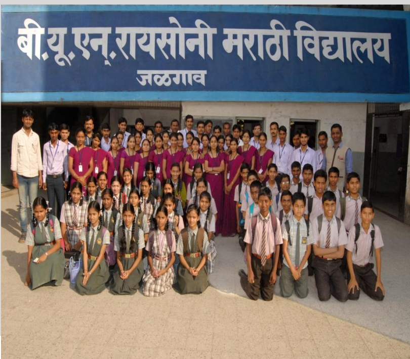
Internship Program at School