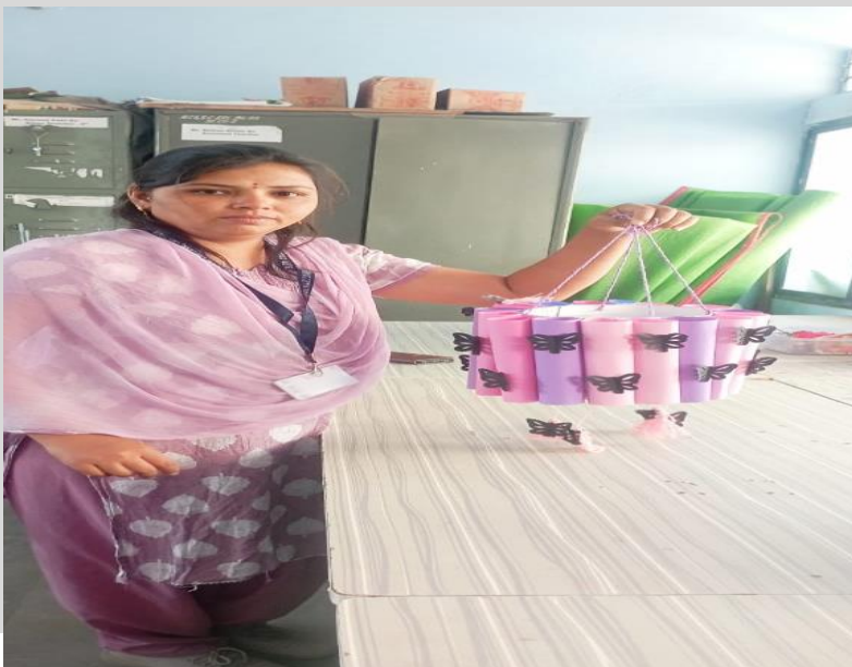
Art's & craft Event