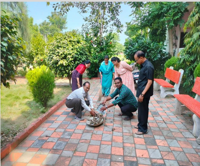
2 nd October Swachh Bharat Abhiyan