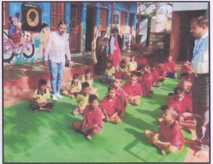
VISIT TO SPECIAL SCHOOL (DISABLED)