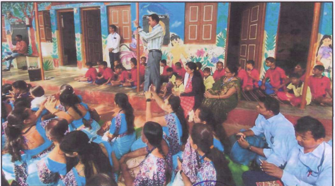
VISIT TO SPECIAL SCHOOL (DISABLED)